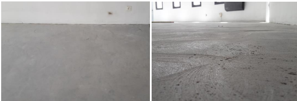
Suitable, solid surface

The solid substrate over which SPORTEC® style is to be installed has to be dry, leveled, free of dust and of foreign material (e.g. residual mortar, oil etc.) as well as free of cracks in the substrate. Best conditions for laying the tiles are a base made of asphalt, concrete or existing typical flooring. Neither this floor has to be clean, dry and free of cracks and any other damages or pollutions. Not possible is to install the tiles on soft undergrounds. The tiles need a solid base for safe bear on the substrate. We recommend equipping the tiles with a fleece on the back, if you install the tiles on existing flooring.